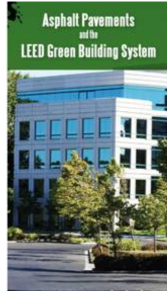
(Click on the photo to read the LEED Brochure)